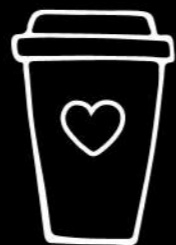
LONG COFFEE / AMERICANO